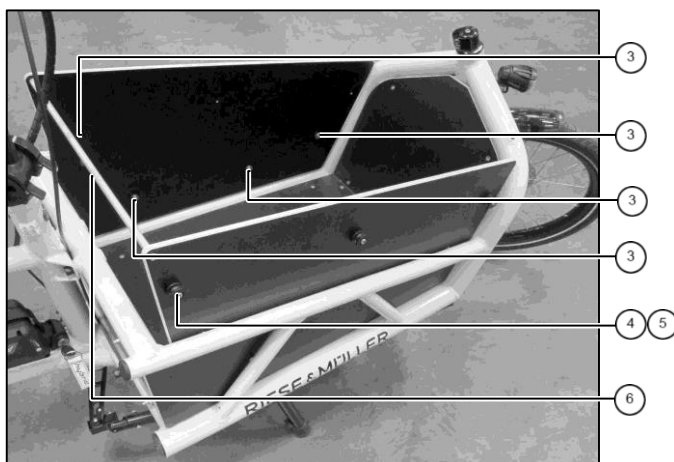
Fig. 1: mounted side walls